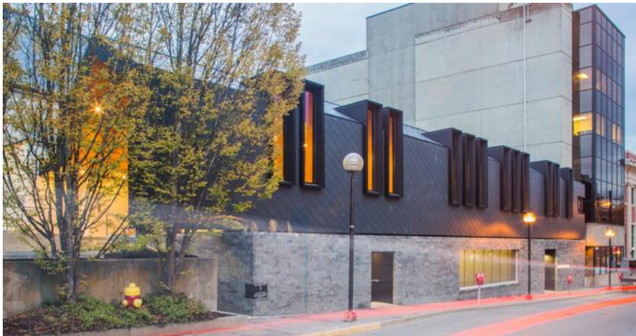
Centre for Ministry and Community Service